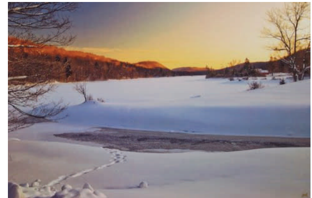
2009 winner Color Anthony Rabasca

Anyone interested in photography is always welcome at the Utica Camera Club!